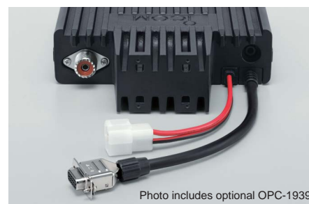
Photo includes optional OPC-1939

With the optional OPC-1939 D-SUB 15-pin ACC cable, the IC-F5023/H series can be programmed to control an operating channel from an external device (up to 16 preprogrammed channels). The ACC connector also provides an ignition sensing function, external PTT, PC command, horn honk, audio output and modulated signal input depending on programming.